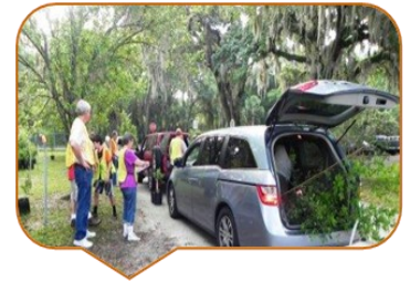
Tree Giveaway Event April 18, 2015

work together to ensure that DeLand's Urban Forest remains one of the things that makes our community special.