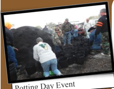
Potting Day Event